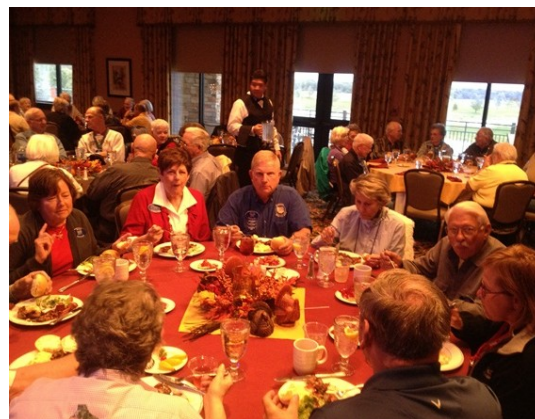
(Continued on page 2)

Happy hour began at 4:30PM at the RV Park Pavilion and at 5:30PM everyone departed for the nearby golf course club house for dinner. The club's dining room is exceptional in its